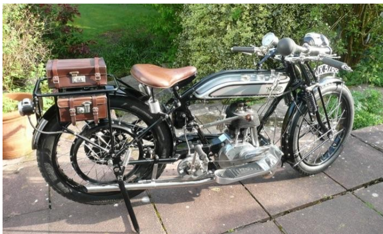
Phil Wilson's 1924 Model 2 Norton, this machine will be at Norton 100.

The venue is approximately 2 miles north of Junction 1 of the A14, virtually in the centre of England, and can be easily reached from all directions, being relatively near to the M6 and M1 motorways. The 2023 event was featured extensively in Old Bike Mart and drew Norton enthusiasts from as far away as Portsmouth, Bristol, Kent and County Durham. We will also be inviting staff from Old Bike Mart, The Classic Motorcycle, Classic Bike, Motorcycle News, Classic Bike Guide and Real Classic.